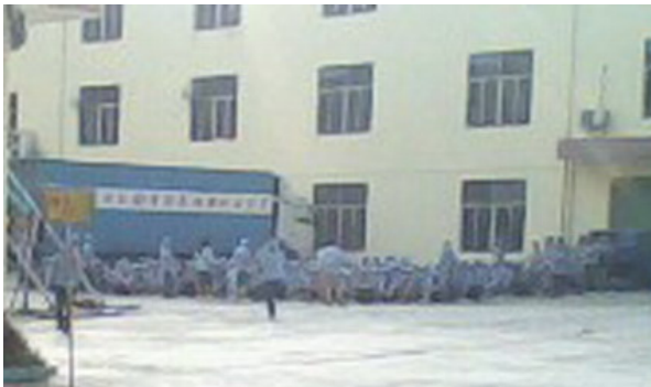
• Pic 2 On a morning meeting.

Employees have a weekly morning meeting with leaders in the factory, including supervisors of the workshops. Regardless of who is running the meeting, employees must arrive at the workshop ten minutes earlier than usual to wait for the leader of the meeting. All of the workers kneel to listen to the leader speak. When the supervisor or manager is unsatisfied with employees' work performance from the previous week, the leader severely chastises workers.