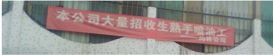
• Pic 11 Bar stating that, direct recruitment is in process, with lots of opening positions.

Workers do not go through a physical exam before employment. All employees will be provided with one-hour orientation training on factory policies, work safety, and so on. Workers are paid during the training period. Contract workers should wear the uniform provided by the factory for free, but the uniform should be returned when a worker leaves the factory.