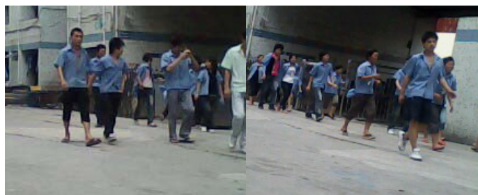
• Pic 3 Workers on-site on a Sunday

Workers' average monthly salary is approximately $268 (1,800 RMB). The calculation of real wages is as follows: basic wage + overtime work – meals ($43/290 RMB) - accommodation ($10.4/70 RMB) - drinking water ($1.5/ 10 RMB). After these deductions, the basic monthly factory wage is approximately $164 (1,100 RMB). The employees work regular hours Monday through Saturday. When working overtime, employees receive a calculated wage increase of 150% (overtime wage is $1.4, or 9.48 RMB per hour). Overtime on Sunday is 200% of the basic wage, and the wage for work performed on a holiday is 300% of the basic hourly wage. If employees work overtime on Sunday, then the following Friday or Saturday, they will receive their wages in cash for the overtime hours worked.