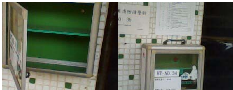
• Pic 4 Empty first aid kit.

The factory has a medical clinic in which employees can buy a few basic medicines. There is no difference between the prices charged by the clinic in the factory and outside pharmacies. The workshop and dormitories both have medical kits, and the outside of the box has a detailed list of the drugs in the kit. Within the medical kit, however, there are no drugs.