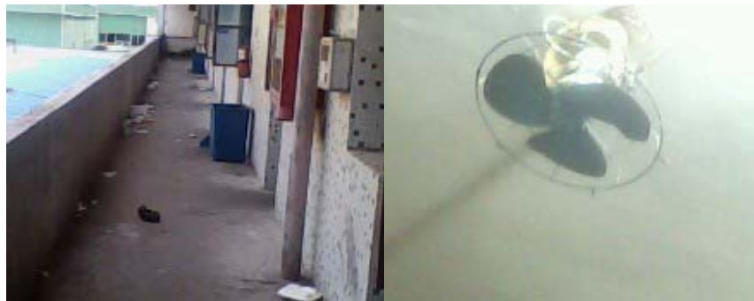
• Pic 9 The hallway of dormitory building.