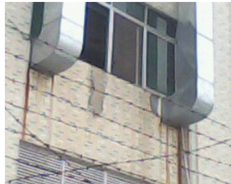
• Pic 12 Exterior view of the factory building.

The use of factory dormitory and canteen is optional, and the service is quite acceptable. The monthly lodging fee is about $4.4 (30 RMB) and the daily dining expense is about $0.88 (6 RMB) including lunch and dinner. Containing 4 bunk beds, a dormitory room can house eight people at most, but usually rooms are not filled. Each dormitory room has its own individual bathroom and hot water is available every night from 10 p.m. to 11:30 p.m. The factory canteen is on the first floor of the dormitory building. Workers each can get three dishes and one soup. All tableware is sterilized, which many employees feel happy about.