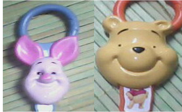
• Pic 1 Products of Hengtai.

Hengtai Factory was established in 1998 and is headquartered in Hong Kong, New Territories. The production factory is located in Pinghu, Longgang District, New Wood Industrial Estate. The factory is over 19,000 square meters, and now has over 2,000 employees. The factory departments include production, administration, human resources, Shipping Department, Customs Departments, Sales Department, Purchasing Department, Finance Department, Warehouse Department, and Quality Control Department, with 16 functional departments and 20 workshops.