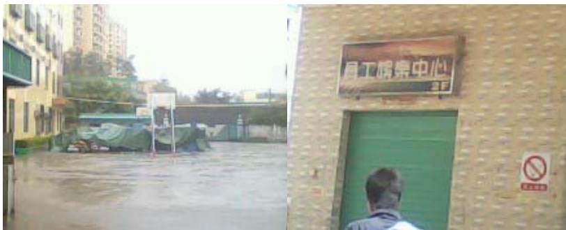
• Pic 5 Basketball court (left) and Recreation Center (right).

During the probation period, employees are not permitted to buy pension insurance. After the probation period has ended, if employees want to purchase insurance, they must fill out a written application, but only after they have paid for it in full. During the new employees training orientation, human resources staff tells workers, "You all are not from Guangdong province, buying this for such a short time is useless. Even if you buy it now, you cannot retire, so it is best not to buy it. But if you really want to buy it, wait until after the probation period is over and then apply."